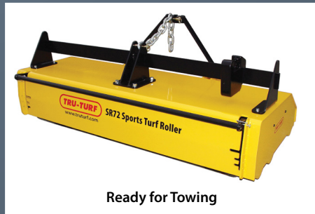
Ready for Towing